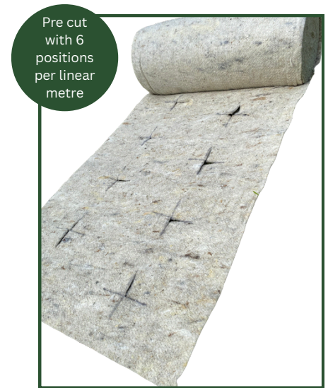
EzeeHedge Mulch Rolls